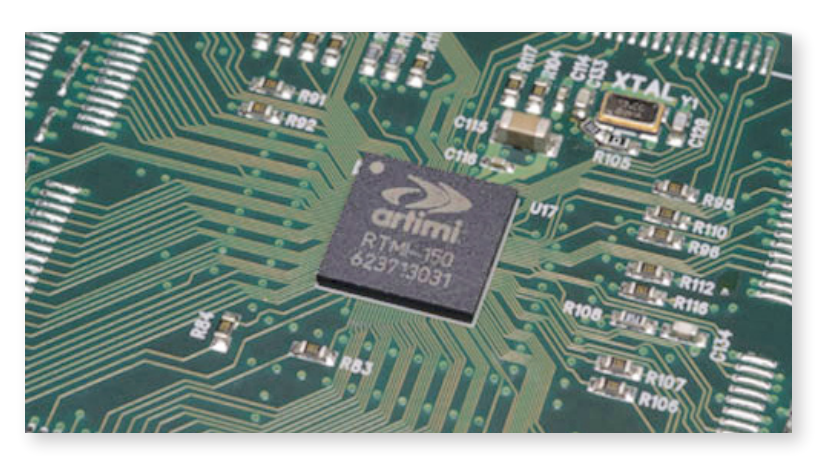
The RTMI-150 is a low power, highly integrated, WiMedia MAC Controller.

And Artimi's test engineers are using an Ellisys Wireless USB Explorer 300 and an UWB Generator 320 to finish the job faster than ever.