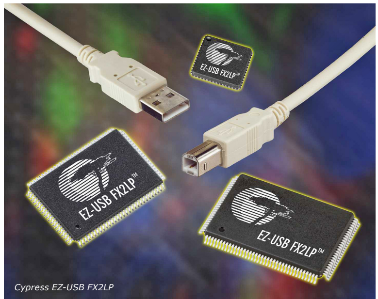
Cypress EZ-USB FX2LP

The two companies came together when Ellisys was sourcing components several years ago. Today Ellisys uses the FX2LP USB microcontroller and other components from Cypress in its units, while Cypress France uses one of the protocol analyzers to support its customers.